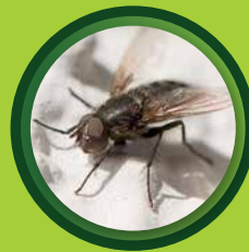
LESSER HOUSE FLIES